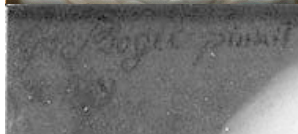
J.162.103 Man in brown coat; & pendant: J.162.1031 Dame, pstl, sd/n.s. √ “G Bogel pinxit/1789” (PC 2023) φ