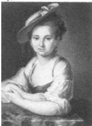
J.153.124 Deux autres portraits, pstl (Vienna, Galerie impériale, 1792). Lit.: Mechel 1784, p. 145, no. 14/15; Fortia de Piles 1796, p. 167 n.r.