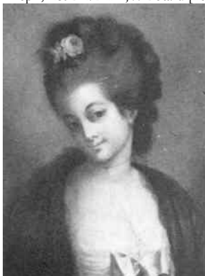
J.153.116 Jeune paysanne, pstl, 50x41.5 (Vienna, Schönbrunn, 55007 AC, ?GG-9845; Castello di Miramare). Lit.: L&R A22 repr.; R&L R92 n.r., ??Liotard [new attr.] φv