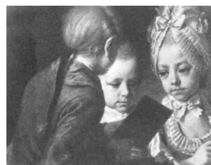
J.153.131 Vier Mädchen und Knaben, pstl, 53.5x69 (Vienna, Schönbrunn, 55015 AC, GG-9853; Castello di Miramare, Trieste). Lit.: L&R A17 repr.; R&L R92 fig. 830, ??Liotard; [new attr.] φv