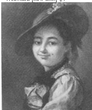
J.153.118 Un jeune paysan; & pendant: J.153.1181 une jeune paysanne du Tyrol, dans leur costume, pstl, 48.7x40.6 (Vienna, Galerie impériale, Cabinet blanc 1781, 1792). Lit.: Mechel 1784, p. 145, no. 14/15; Fortia de Piles 1796, p. 167 n.r.