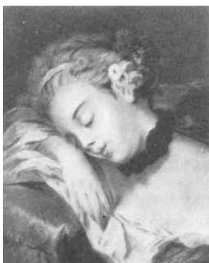
J.153.114 Jeune fille avec rose aux cheveux, pstl, 48.5x37 (Vienna, Schönbrunn, 55018 AC, GG-9856; Castello di Miramare). Lit.: L&R A20 repr.; R&L R92 n.r., ??Liotard [new attr.] φv