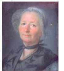
Dame en robe bleue, 65.4x54 (Paris, Sotheby's, 27.VI.2002, Lot 34 repr., entourage de Valade, est. €2200–3000, b/i; Paris, Drouot, Choppin de Janvry, 27.IX.2002, Lot 154 repr., Éc. fr., est. €2800–3000; Toulouse, château de Lasserie, Machoir, 9–10.II.2003, as L. Vigée). Lit.: Gazette Drouot , 31.I.2003, repr. p. 118 [new attr., ?] ◐