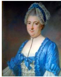
Dame, pstl, 65x55 (Rome, Palazzo di Venezia. Sangiorgi Gallery, Rome, 1912, as La Tour). Style of Marianne Loir [new attr., ?] ◐