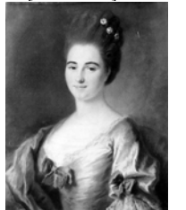
Femme de qualité en cape bleue, 64x54 (Paris?, 6.VI.1990, Lot 57 repr. Metz, Ban-Saint-Martin, Rémy & Godart, 20.I.2002, est. €3049–3811, attr. Paris, 2.XII.2002, Lot 46 repr.)