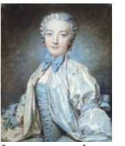
Inconnue en chasseresse, pstl/ppr, 30.8x24.9, sd 1769 (Aix-en-Provence, musée Granet. Don J.-B. Bourignon de Fabregoules 1860). Exh.: Aix 1974, no. 102 n.r.