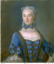
Dame faisant des nœuds, pstl, 72x58, 1759 (Galerie Marcus, Paris, 1967 cat., repr.) ◐