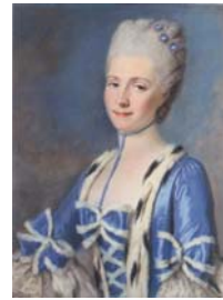
Dame en robe blanche, manteau bleu clair, pstl/vl, 65x54 (Vichy, Guy Laurent, 15.V.2004, Lot 91 repr.) [new attr.] ◐