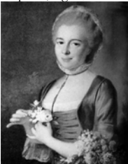
Jeune femme en robe bleue, manteau de satin blanc, pstl/ppr bl., 60x50, sd → “Bernard p. 1767”, inscr. verso (Louvre Rec 10. Comtesse de Chastaignes, née Godefroy-Menilglaise 1909; legs: Jean de Chastaignes. Cailleux; acqu. 1941 Kaiser Wilhelm Museum, Krefeld, Fr35,000. Office des Biens, 23.III.1949, dep.: Besançon 1952–96, inv. D.952.5.2). Exh.: Paris 1997a ◐