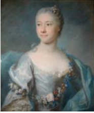
Beaumarchais, v. Caron

Susanne-Simonne-Fernande de Ténarre de Montmain (1722–1800), pstl, 57.5x48 (PC 2006) [new attr.] ♀