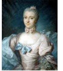
Jeune femme en robe bleue, pstl, 62x50 (Paris, Drouot, Couturier Nicolaj, 22.XII.1995, Lot 20 repr., entourage de Valade, est. Fr20,000) [new attr., ?] ◐