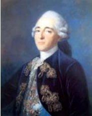
Châteauneuf, v. Peyre

??Pierre-Augustin CARON DE BEAUMARCHAIS (1732–1799), auteur dramatique, pstl, 64x50 (Paris, Drouot, Ferri, 3.VI.1998, Lot 26 repr., attr. Boze, F25,000; ?Vienna, 7.X.1998, Lot 262 repr.) [new attr.] ♂