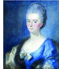
Dame en robe doublée de fourrure, tenant une boîte, pstl, 80x63 (Avignon, Hôtel des ventes, 27.XI.2010, Lot 34 repr., attr., est. €1500–2000) [Attr.] ◐