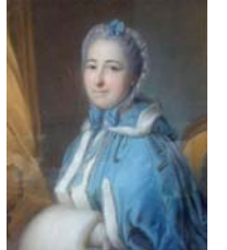
=? Femme en cape bleue, pstl. Exh.: Marseille 1906, no. 766. Lit.: Billioud 1937, no. 23 n.r.