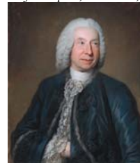
Homme en habit noir; & pendant: dame en robe bleue, pstl, 64x52, sd ←/↖ “Bernard pinxit/1757” (Clermont-Ferrand, Vassy Jalenques, 6.II.2010, Lot 147 repr.; PC) ◐