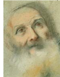
Head of a bearded man looking down, red, black chlk, pstl/bluish-green ppr, 34.8x24.9 (Melbourne, National Gallery of Victoria, 562-4. Legs Howard Spensley 1939) \bullet