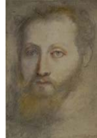
Head of Anchises, c.1587 (Royal Collection RCIN 905233. Acqu. a.1810) \phi