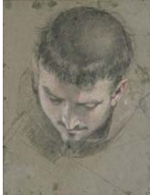
=?tête précieuse de religieux qui regarde en bas, m/u, 33.8x25 (Jean de Jullienne; cat. 1756, p. 76 repr.; Paris, Martin, Remy, 30.III.–22.V.1767, Lot 365, 16 livres 1). Lit.: London 2011a, p. 46 repr., as ?=Lot 364 religieux, vu de face, trois crayons, 32.5x21.7 [here suggested as Lot 365]