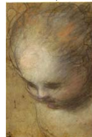
Head of the Madonna, c.1582 (Royal Collection RCIN 905231. Acqu. a.1810) φ