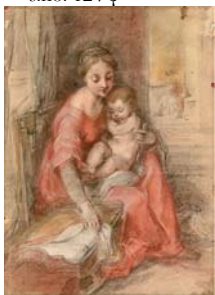
Testina, pstl, Florence 1737 (F. Pieri)

repr., est. £500–800,000, £505,250). Exh.: Barocci 1975a, no. 303. Lit.: Barocci 1975b, s.no. 124 ♀