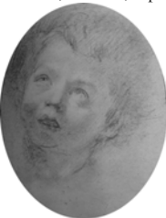
~two of the Christ Church pstls. Exh.: Barocci 1975a, no. 199, 200. Lit.: Pillsbury 1976, p. 62 n.r.