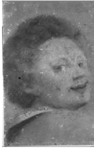
Tête de moine, pstl, pierre noire, 31.2x23.7 (Louvre inv. 2874. Saint-Morys) φ