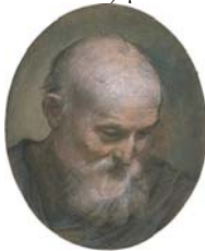
Head of a bearded man, chlk, pstl/ppr, 23.4x18.3 (Hermitage. Comte Cobenzl, Bruxelles, acqu. 1768) φ