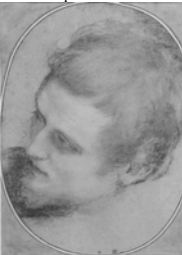
Tête de saint Jean-Baptiste, pstl, a/r Correggio, 37.8x27.8 (Paris, ENSBA, inv. EBA 33. Don his de La Salle). Exh.: Corrège , Paris 1934, no. 103; Paris 1935f, no. 16 φ