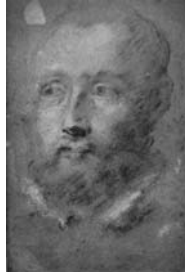
San Vitale, testa, chlk, pstl, 30.8x22.9 (Genoa, Palazzo Rosso, inv. D.2242. Legs Marcello Durazzo 1848). Lit.: Piero Boccardo, I grandi disegni, Palazzo Rosso , 1999, no. 16 repr. \phi