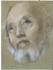
Head of an old bearded man, chlk, pstl/ppr, 35.7x24.7 (Hermitage. Acqu. a. 1797) φ