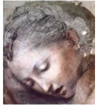
Donna, pstl (Filippo II Colonna, Rome, inv. 15.XII.1714 – 26.II.1716)