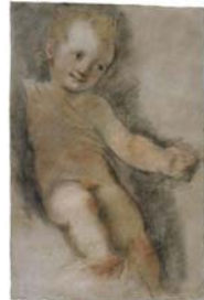
Cupid drawing his bow, black chalk, pstl, white chalk/ppr, 42.4x27.2, c.1560 (Cleveland, inv. 1969.70. Acqu. Dudley P. Allen & Delia E. Holden funds) \phi