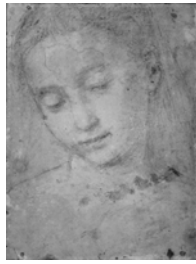
Jeune femme, 39.5x27 (Franz Wilhelm Koenigs (1881–1941), Haarlem, 1934). Exh.: Amsterdam 1934, no. 2 n.r.