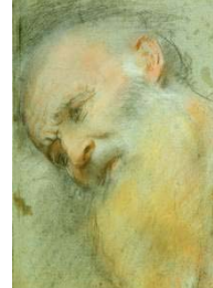
Head of an old man, cr. clr/ppr, 34.6x25.4, c.1575 (Royal Collection RL 5232). Exh.: London 2006c, repr. \phi