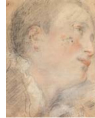
Head of a man looking down, cr. clr/ppr bl., 19.4x18.5 (G. Piancastelli (1845–1926), Rome. New York, Sotheby's, 14.I.1992, Lot 40 repr., est. $24–28,000; Jak Katalan; London, Sotheby's, 10.VII.2002, Lot 4, est. £30–40,000). Exh.: Poughkeepsie 1995, no. 16 φ