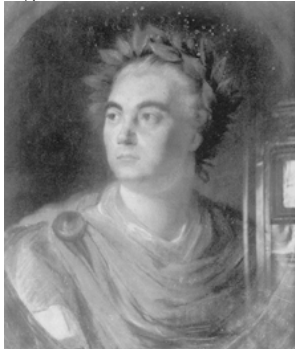
J.124.122 ~cop., pstl, 63x52 (Issoudun, Antoine Aguttes, 22.XII.2015, Lot 47 repr., anon., inconnu, est. €200–300) φκ