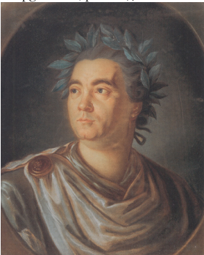
J.124.114 ~version, pstl/pchm, 47x36 (Paris, Comédie-Française, I 0329) Φβ