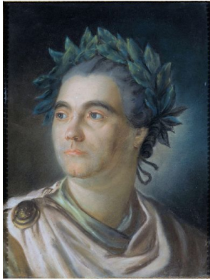
J.124.117 ~version, pstl (PC). Lit.: Paris, 23.II.2005 cat., n.r.