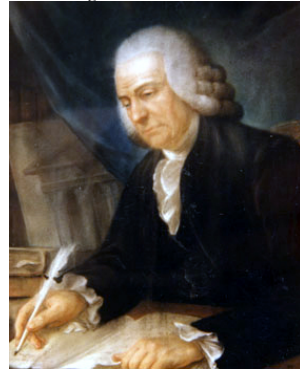
~cop., Numa Boucoiran pnt., 1852 (Nîmes, Académie, comm. académiciens)