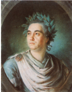
=?LEKAIN, pstl (Moreau-Chaslon 1888). Exh.: Paris 1888b, no. 289 n.r. anon., v. J.9.20342