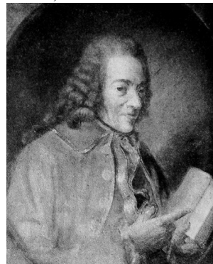
J.124.129 =?pstl (Moreau-Chaslon 1888, with anon. pendant of Lekain). Paris 1888b, no. 13 n.r.