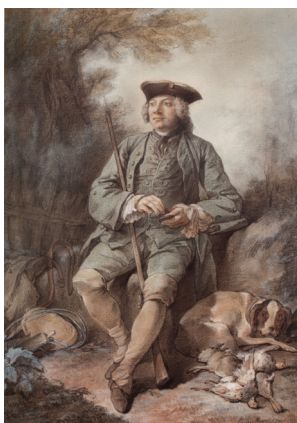
J.1142.105 Un artiste, cr. clr, gch., 33.5x26 ov. (Jean Masson; Paris, Petit, 7–8.V.1923, Lot 1 repr.). Exh.: Paris 1920a, no. 130 [est. FF2500] φ