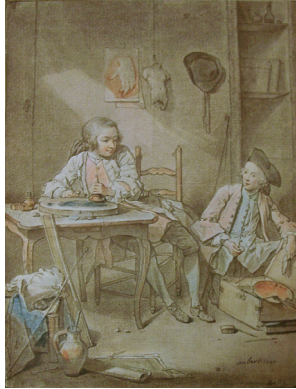
J.1142.144 La visionneuse, cr. clr, inscr. ✓ 1747 (Vienna, Albertina) φ