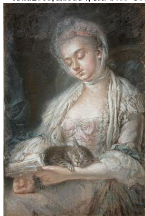
La leçon de lecture, pnt., 32.5x22.7, sd 1740 (Amiens, musée de Picardie. Lavalard de Roye; legs 1890). Exh.: Karlsruhe 1999?; Columbia 2000, no. 25 repr.; Beauvais 2010. Lit.: Burlington magazine , X.1999 repr.

~grav. Angélique Papavoine (1759–), Ce n’est pas cela (P&B)