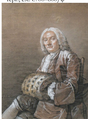
J.1142.115 Le jeune amateur de dessins, pstl, gch., crayon noir, 27x19.7, s ↓ “L. Aubert [...]” (Paris, Drouot, 16–17.V.1898, Lot 19, ff141; Paris, Drouot, 20.III.1899, Lot 1, ff102; Gaston Delestre; desc.: Paris, Artcurial, 22.III.2017, Lot 108 repr., est. €10–15,000, €81,900). Exh.: Paris 1950b, no. 86 φ