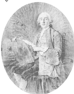
J.1142.107 Homme, deux cr., pstl, 23x18, s “L. Aubert” (Jean Masson; Paris, Petit, 7–8.V.1923, Lot 2 repr.). Exh.: Paris 1920a, no. 129 [est. FF5000] φ