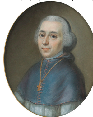
J.108.162 Gerhardus EVERTS (1742–1793), pstl. Lit.: rKD n.r.