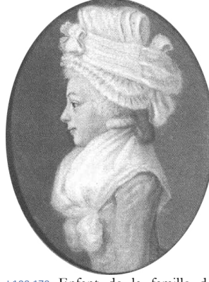
J.108.178 Enfant de la famille de GIJSELAAR, pstl/ppr, 13.6x10.9 ov., sd 1792 (Leiden, Stedelijk Museum de Lakenhal, S710) φ