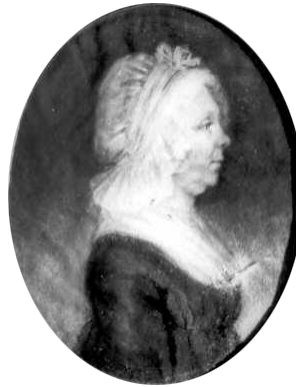
J.108.167 Jasper GANDERHEIJDEN (1755–1829), pstl/ppr, 13.5x11.5 ov., 1807 (Amsterdam, Christie’s, 10.XI.1999, Lot 451 n.r., Df/1500)